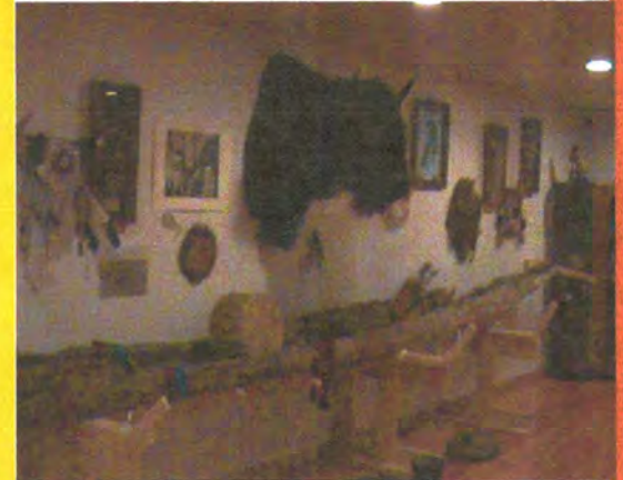
Dug out Canoe Found on Bryant Creek

Come see what was Around Before the Coming of the White Man